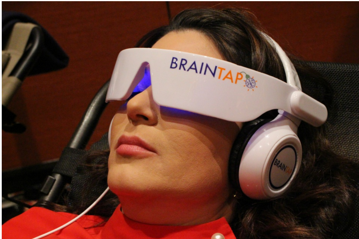
BrainTap, a device designed to induce a meditative state, is part of a mindfulness industry that is growing steadily.

When Eric Chang, a software engineer at Google's Silicon Valley headquarters, enrolled in the company's Search Inside Yourself (SIY) meditation course, he wanted to see hard evidence that showed the benefits of the program. 1